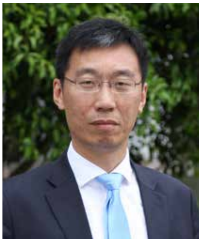
Cao Ran Bertrams Chemical Plants China

Another issue with any bilateral trade treaty is that modern supply chain has become increasingly complex and it is commonplace for goods to be produced from components or raw materials that are sourced from numerous other countries. In the case of Switzerland, with its strong ties to the EU, this has proved a stumbling block. One example is Bertrams Chemical Plants. "The VNM (value of non-originating materials) for our raw materials is too big for us to enjoy savings from the FTA as these are mainly