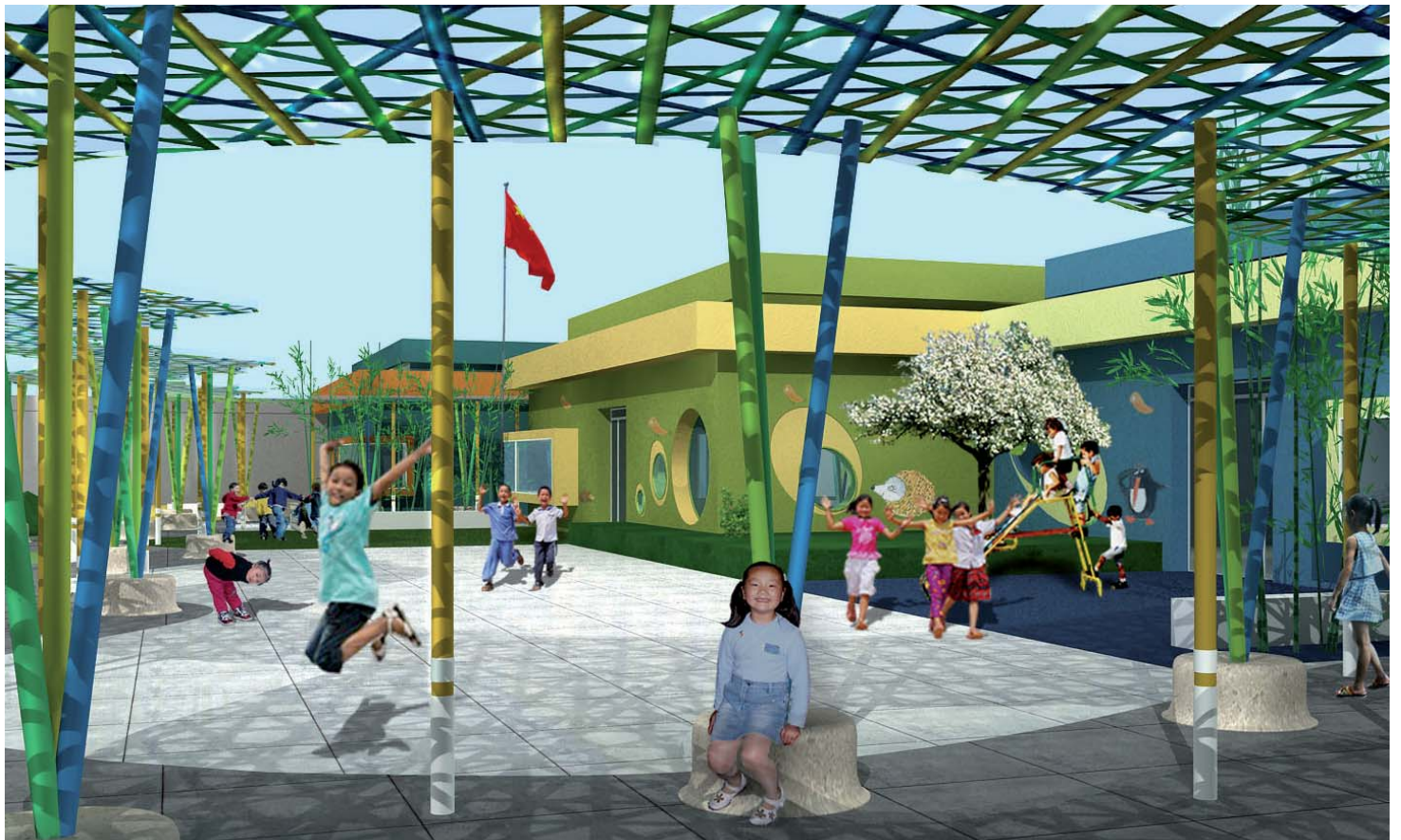
学校内庭透视图 Perspective inside the school

为了给孩子创造一种在行走中学习和探索的环境，受到传统中国园林的启发，德建采用了游龙形走廊把整个校园区分成几个区域。在形似游龙的红蓝走廊的引导下，孩子们将被引导到各自的教室，由于每个教室的外墙都有不同的颜色和不同的动物，孩子们可以很容易地找到教室。In order to create a feeling of learning and exploring by walking inside the school, Virtuarch has used dragon-shaped covered corridors to link all buildings as well as to separate the long plot into different spaces. The corridors are inspired by traditional Chinese garden design. By following the red or the blue dragon corridor, children will be led to their classroom and will easily recognize it as each classroom building has a different colour and a different animal painted on it.